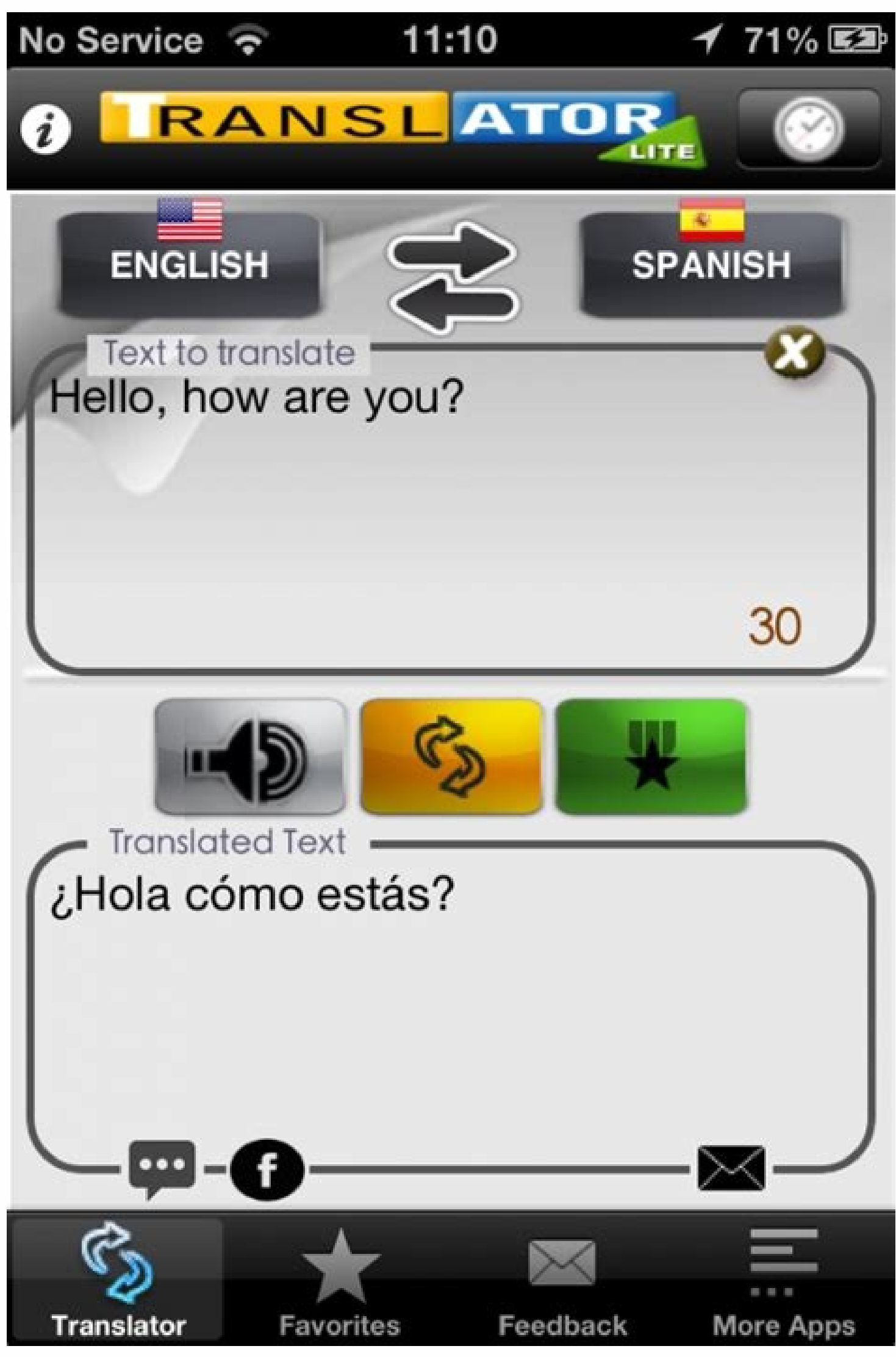
#1 Spanish English Translator and Dictionary